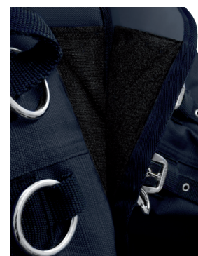
Practical: the double closure at the front with snap hooks (Picture: .jpg)