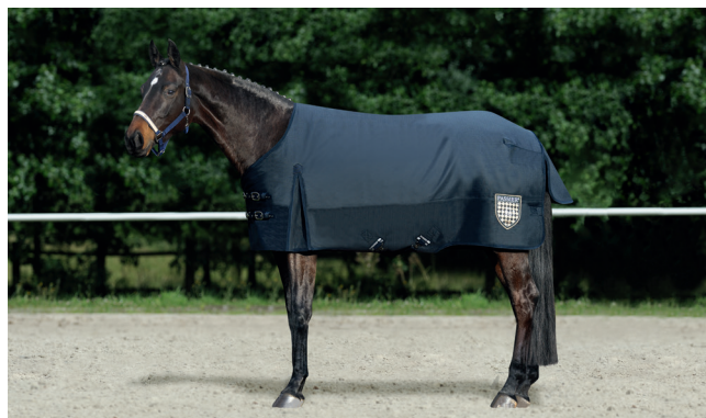
Perfect fit: the horse-friendly Turnout Rug by Passier!